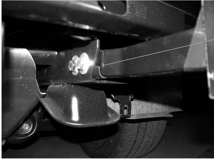
FIG.2 No shims toward inside of vehicle