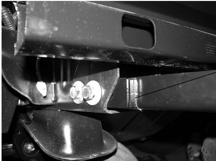
FIG.3 Passenger side shims installed toward outside of vehicle