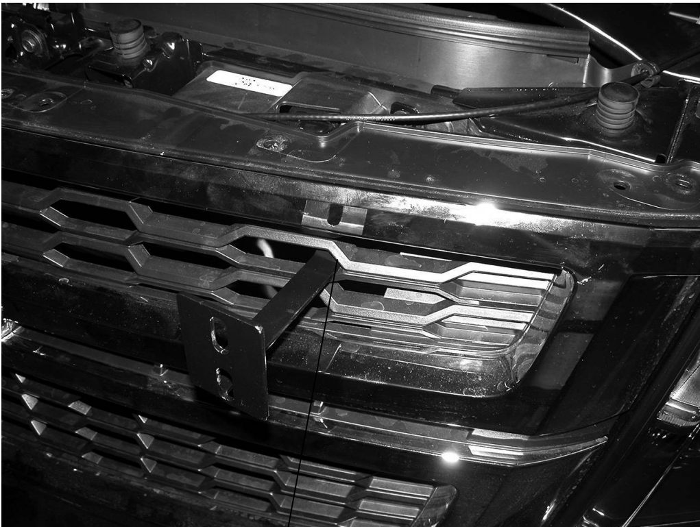
Install upper stability bracket through grill. Both sides of vehicle