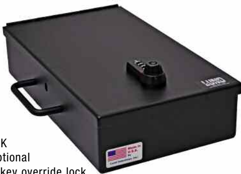
VPB-814D-CK shown w/ optional Combi-Cam key override lock

Lund's pick-up truck box is a 2 drawer aluminum lock box system. The upper drawer has an outside dimension of 51" long x 22" wide x 4" high, the lower drawer of 18" long x 22" wide x 10.5" high. Both drawers are available with several lock options and both have foam bottom pad. The top of the SSPU-5222 features a unique top rail that provides storage, and is slotted for tie down straps. Designed to install on either side of the pick-up truck bed with an interchangeable side panel that covers the open area of the wheel well. Powder coated black epoxy finish provides long life and ease of cleaning.