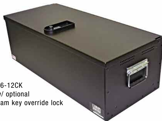
LGV-1636-12CK shown w/ optional Combi-Cam key override lock

LGV-1636B (36" x 16" x 7") List price.....$787.95 LGV-1636B-CK List price.....$742.95